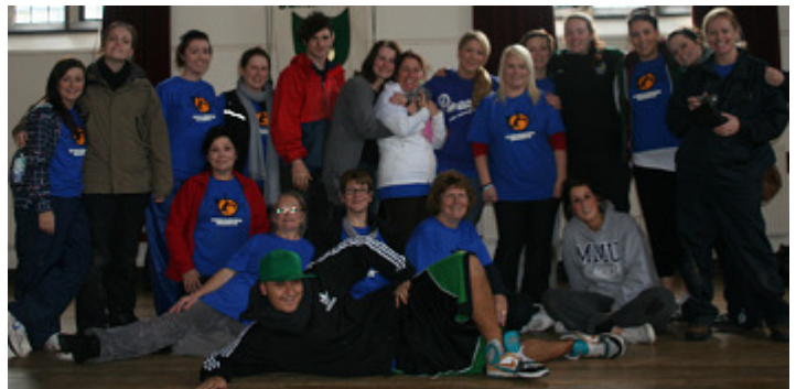
The Moment When facilitators - why not see if you can recognize yours!

Each of the shows in The Moment When... has a number of facilitators working on it. Each facilitator is responsible for co-ordinating the work of up to six of the dance groups participating in the project. Your facilitator should be the first point of contact for any questions or concerns. If this isn't possible, you can also contact Cheshire Dance using the details opposite.