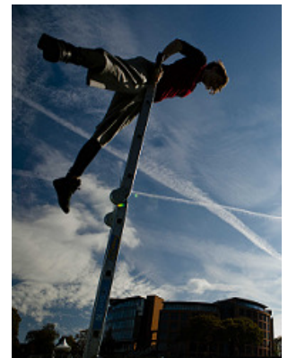
Rehearsing at Chester

2012 promises to be an inspirational and exciting year, and The Moment When... is inspired by the moment an athlete first decides they want to become an Olympian, as well as moments of change in everyday life. There will be up to five hundred community performers in each show, working in up to sixty-five different performance groups. Each of these groups is involved in the creative development of the shows.